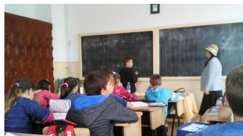
Consults at school