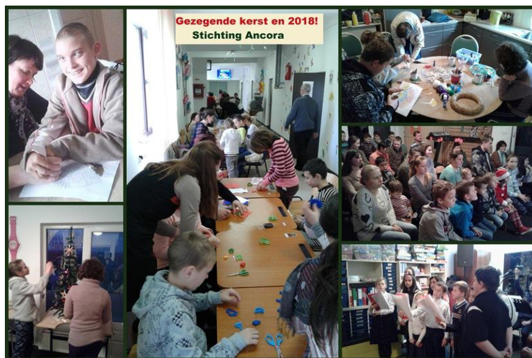
Christmas activities: making decorations, singing Christmas carols together, and spending time with those from the Special School Trinitas in Tg. Frumos