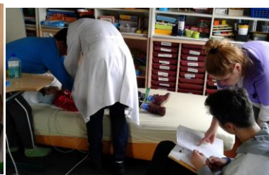
Medical and legal consults