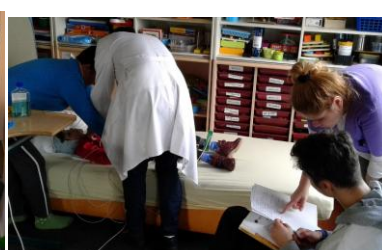
Medical and legal consults