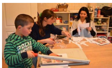
Adapted activities of daily living