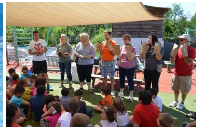
Our own psychology practices in Iași Enjoying the pool A programme with volunteers from the USA