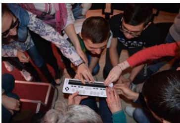
Electronic braille reader