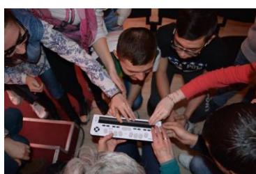
Electronic braille reader