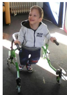
Orthopaedic aids from the Netherlands find their way to those who need them