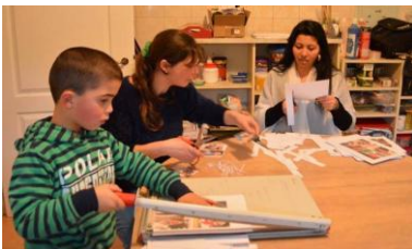
Adapted activities of daily living