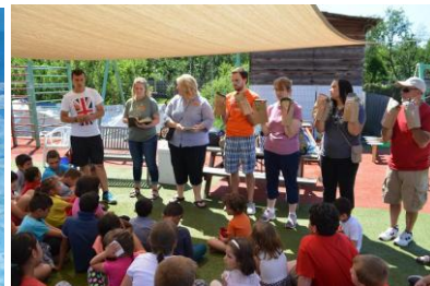
Our own psychology practices in Iași